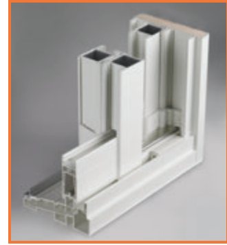
Corner Cross Section

It's our first, last and middle names. Some of the most skilled and experienced craftspeople make our products with such overwhelming pride. They make sure you receive...All vinyl multi-chamber profile design...Full perimeter double and triple weather stripping...Removable panel support...Premium sealant...Anodized aluminum tracks...Zinc plated double tandem wheels with sealed bearing...Extruded aluminum screen. Everyone at VWD shares one and only one goal: providing customers with not only the highest quality, longest lasting, easy-to-use doors but also highest value products available anywhere.